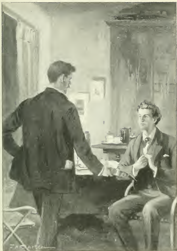
"You smoke, I hope?"—Page 42